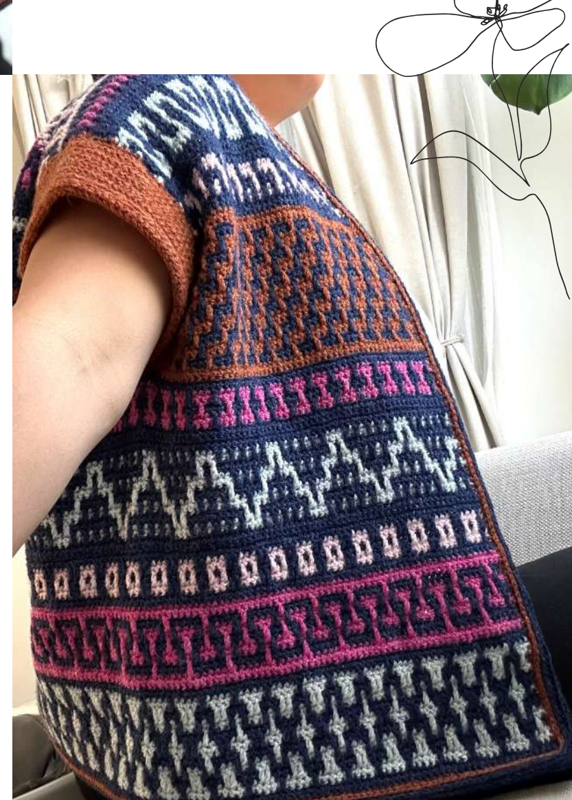
Chart 7 is my favourite! I only used 5 colours and this made it a lot easier for me to manage how the colours played together, and I absolutely love how it's come out. Hardest bit was deciding sleeve length. My advice is to practice the swatch so you really understand how mosaic crochet works.